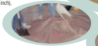
No special equipment is needed to mix aggregates. Simply mix by sight to the desired color consistency.