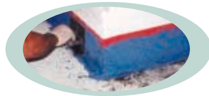
Details such as coving and tooling around drains can also be done with the Euco epoxy Tufcoat DBS System.

After mixing, the epoxy basecoat is applied to the concrete floor using a roller or squeegee. The quartz aggregate is broadcast into the wet epoxy and this first application is allowed to dry. Excess quartz is then removed from the surface, and a second coat of epoxy is applied. At this point, the floor is complete if a "single broadcast" (1/16 inch thick) system is desired. For a richer, more uniform color and thicker system (1/8 inch), an additional layer of quartz can be broadcast over the second coat of epoxy. The final topcoat of epoxy is applied at various coverage rates to provide a textured, non-slip finish or a smoother, glossy appearance.