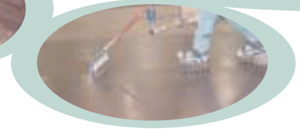
For exceptional abrasion and chemical resistance and a high-gloss appearance, a coat of Eucothane – Euclid's high-performance polyurethane coating – can be applied as the final finish.