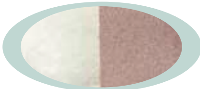
Before and after the application of EUCOPOXY TUFLOAT DBS